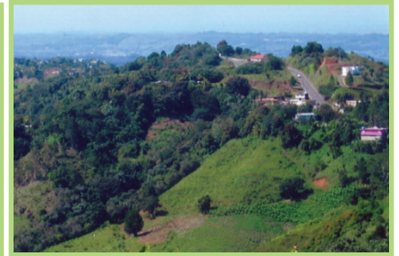
Maná Sector, Corozal, P.R.