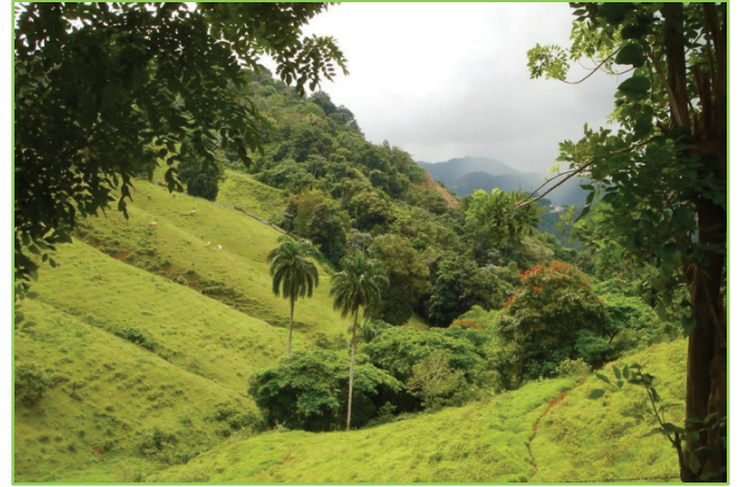
Achote Ward, Naranjito, Puerto Rico