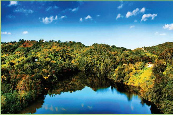
La Plata Lake in Naranjito, Puerto Rico