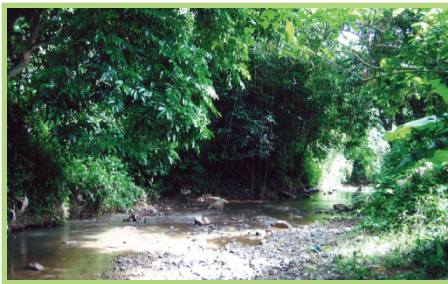
Monte Choca Reserve, Corozal, P.R.