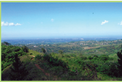
North View, Corozal, P.R.